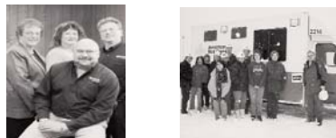
K-Tech Weston McCain Foods USA Plover